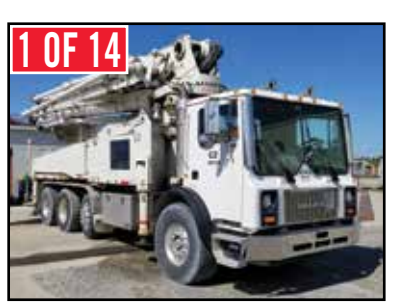
(14) MACK, SCHWING, TUCKERBILT, & OSHKOSH Concrete Trucks