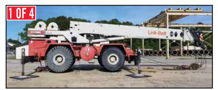
(4) LINKBELT, AMERICAN & GROVE Truck, Revolver & Rough Terrain Cranes