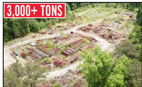
3,000+ Tons of Scrap Steel Covering 20+ Acres