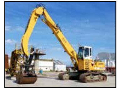
LIEBHERR, TRACKMOBILE, CAT & Other Excavators, Loaders & Railcar Movers