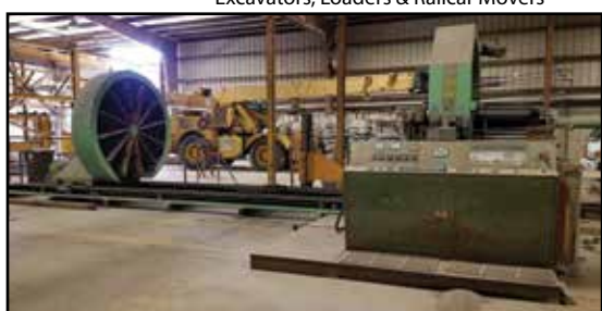
Spuncast Concrete Casting Equipment