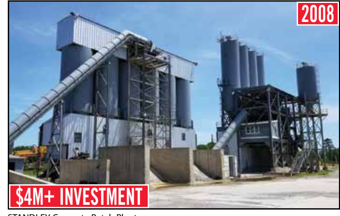
STANDLEY Concrete Batch Plant

INSPECTION: DAY PRIOR TO AUCTION FROM 9AM - 4PM